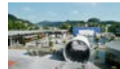
The interactive Swiss Museum of Transport in Lucerne

You'll find a list of all museums here: MySwitzerland.com/500museums