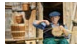
Watch craftsmen in action at the Open-Air Museum Ballenberg