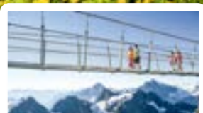
TITLIS CLIFF WALK Europe's highest suspension bridge