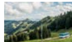
A ride up to Mount Rigi in the heart of Central Switzerland

Train, bus and boat are perfectly synchronised on the world's densest traffic network. When the train arrives, bus and boat are at the ready in walking distance. Easy, convenient and direct.