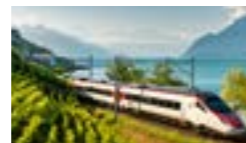
Travel through the Lavaux vineyards – a UNESCO World Heritage Site

Find out more: MySwitzerland.com/swisstravelsystem