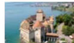
The prestigious Chillon Castle on the shores of Lake Geneva

The Swiss Travel Pass is also your entry ticket to the world of museums. Benefit from free admission to more than 500 museums – unlimitedly. The following six are particularly popular. Just show your Swiss Travel Pass at the entrance and step in!