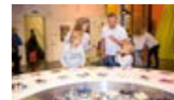
A yummy experience in the chocolate museum Frey