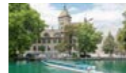
Immerse yourself in Swiss history at the National Museum in Zurich