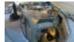
Glacier Garden in the heart of Lucerne