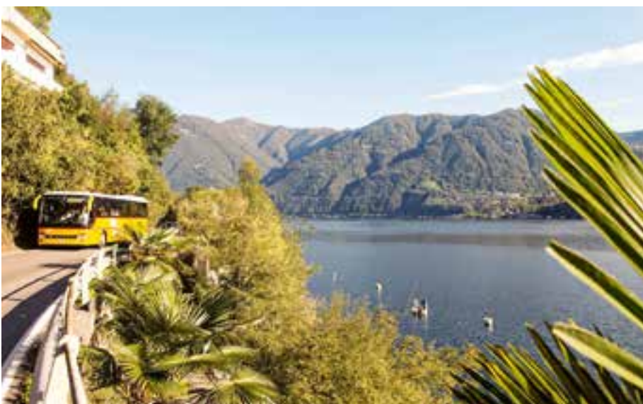
Palm Express passing Lake Como, Italy

mystsnet.com/palmexpress postauto.ch/palm-express