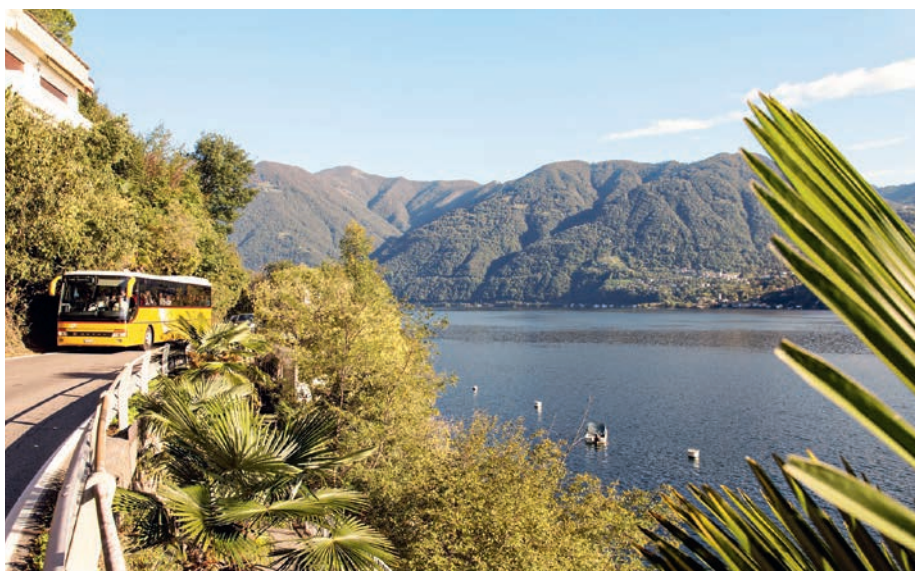
Palm Express passing Lake Como, Italy