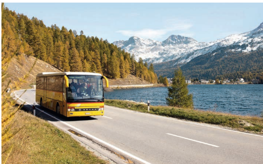
Postbus passing Lake Sils, Upper Engadine, Grisons