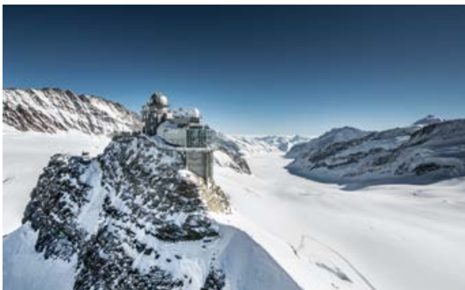
Sphinx and Aletsch Glacier, Jungfrauoch, Bernese Oberland