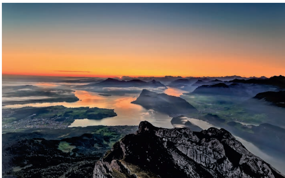
Panorama of Lake Lucerne, Central Switzerland