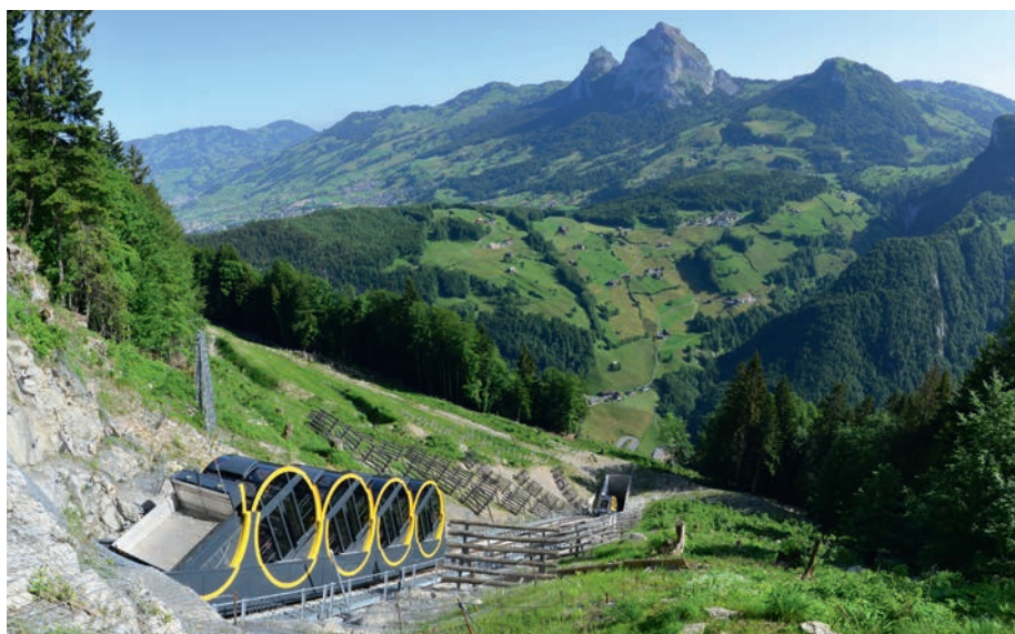
Stoos funicular, Central Switzerland

Prices valid throughout 2019. Subject to change.