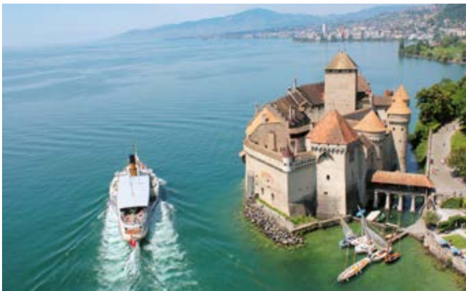
Steamboat next to Chillon Castle, Vevy, Lake Geneva region

Prices valid throughout 2023. Subject to change.