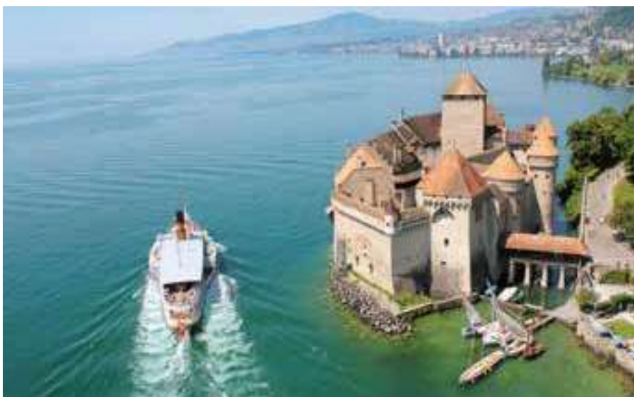
Steam boat next to Chillon Castle, Vevytau, Lake Geneva region

Prices valid throughout 2022. Subject to change.