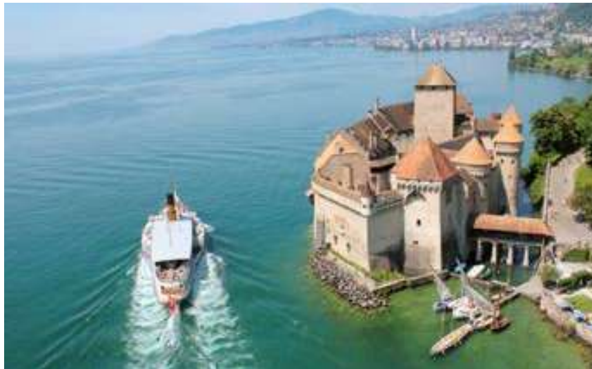
Steam boat next to Chillon Castle, Veveytaux, Lake Geneva region

Prices valid throughout 2021. Subject to change.