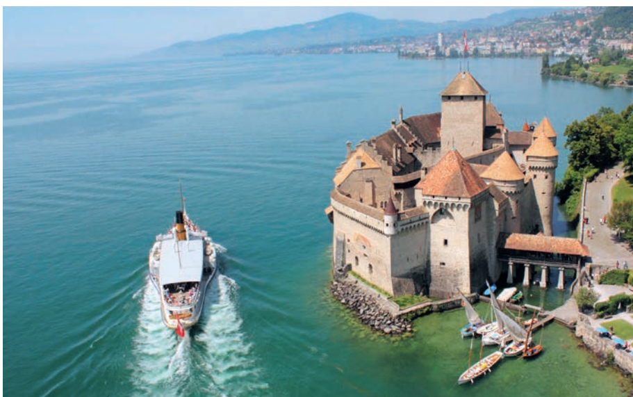
Chillon Castle and CGN boat, Veytaux, Lake Geneva region

Prices valid throughout 2020. Subject to change.